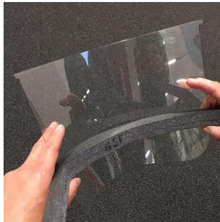
Slide face shield through foam headband up to tabs.