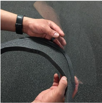
Insert curved edge of face shield into top of foam headband.