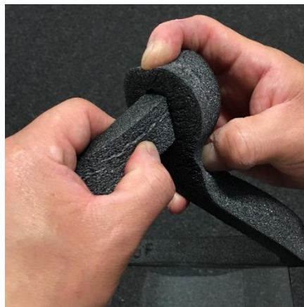
Insert headband adjustment arm into the open eyelet.