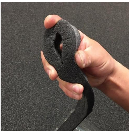
Open foam eyelet by pressing down on the curved edge.